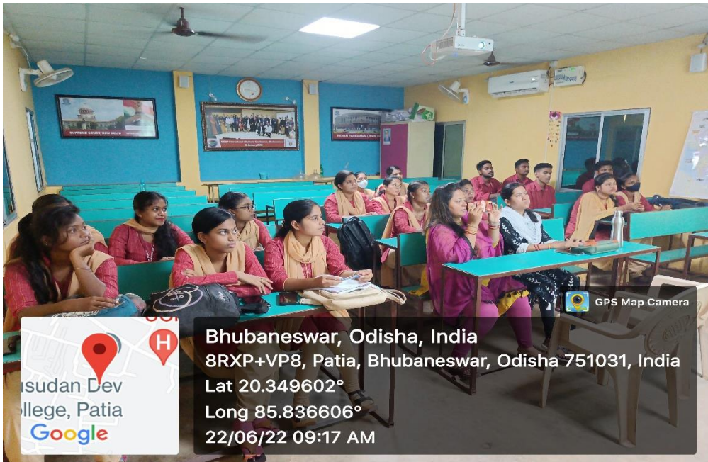
HALL-B, IQAC Hall