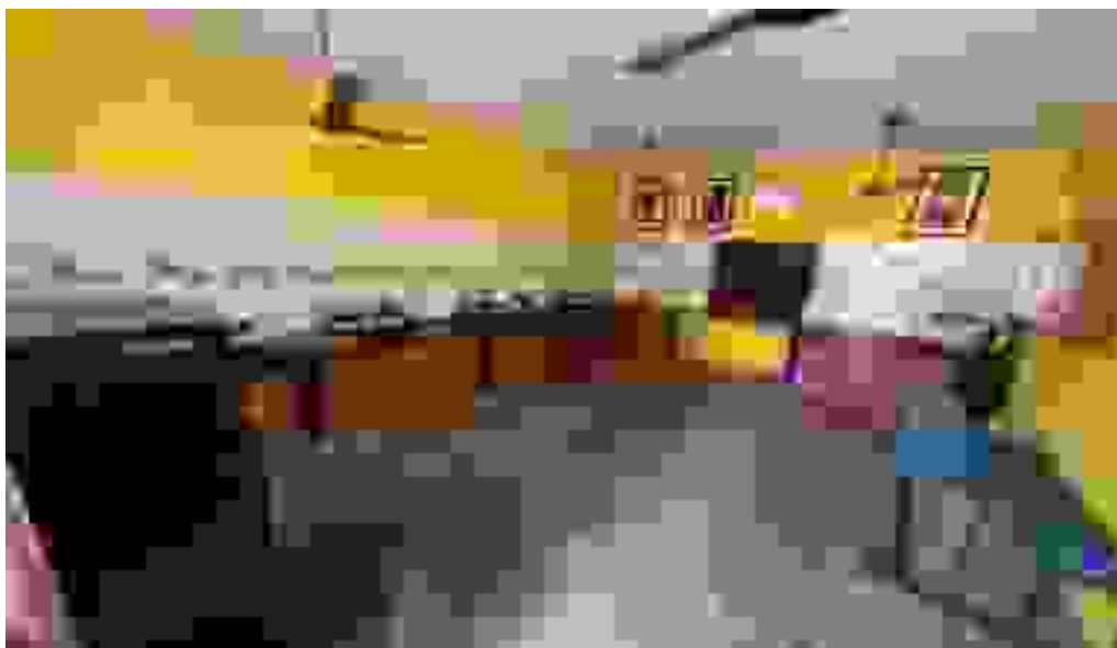
Home Science Lab