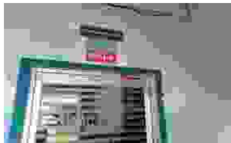
Class Rooms of College