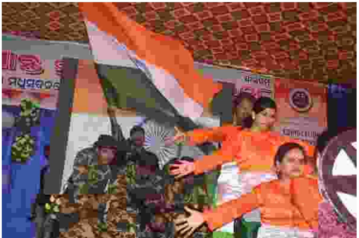
Annual Function at stage in Playground