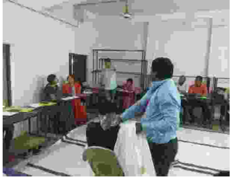
Indoor Program being held by YRC at College