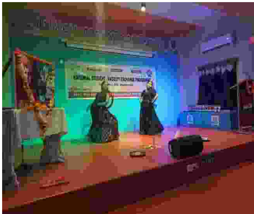
Cultural Program at SCC Hall