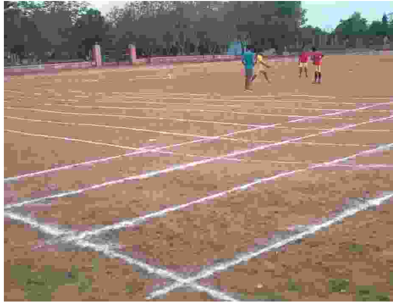
College Playground Football ground