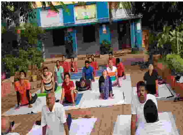
National Yoga Day

4.1.2 The institution has adequate facilities for cultural activities, sports, games (indoor, outdoor) Gymnasium, yoga etc.