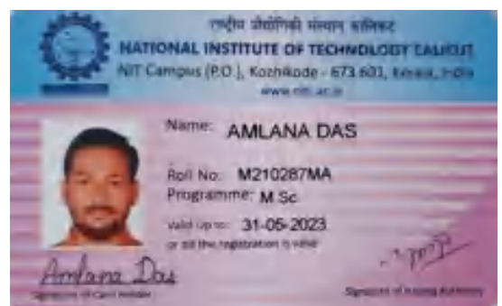
5.2.2: Average percentage of students progressing to higher education during the last five years