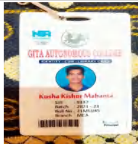
5.2.2: Average percentage of students progressing to higher education during the last five years