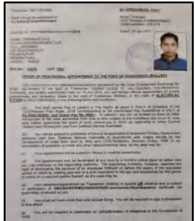
Chiranjiv Dash (B.A Pol. Sc. 2016 passed out) (India Navy)