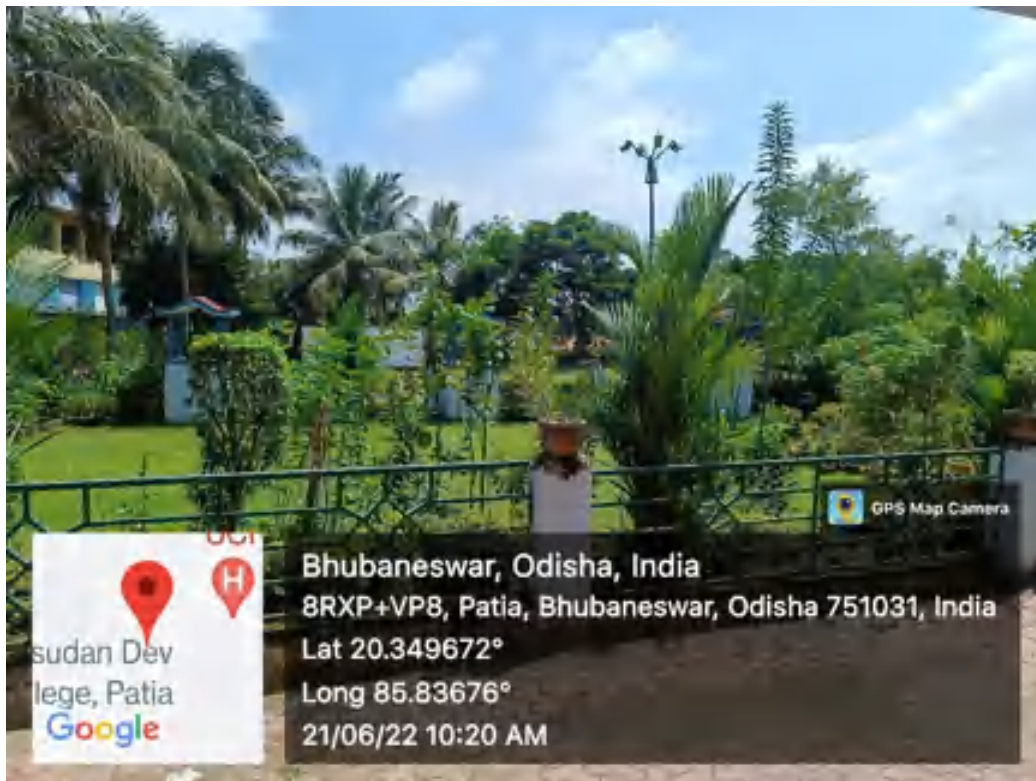
landscaping with trees and plants