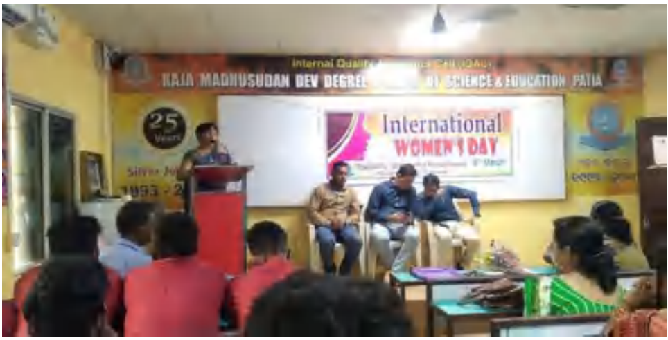
International Women's Day 08<sup>TH</sup> March 2020