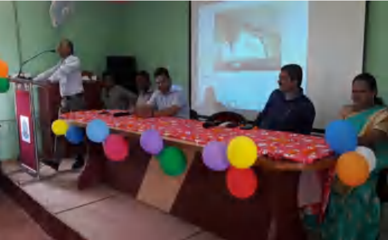
Teachers Day & Children's Day Celebration