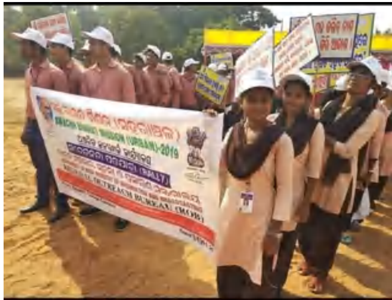
Swachh Bharat Mission Rally