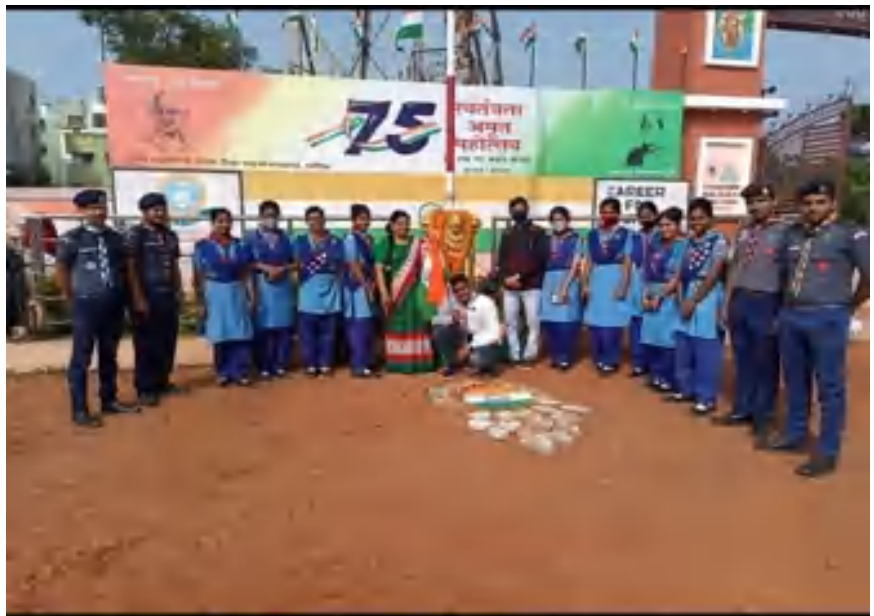
Independence Day & Republic Day