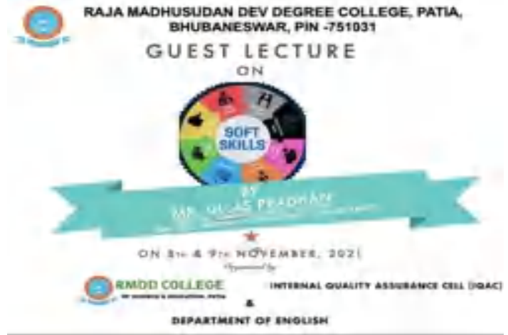
Workshop on Soft skill development and Communiuation