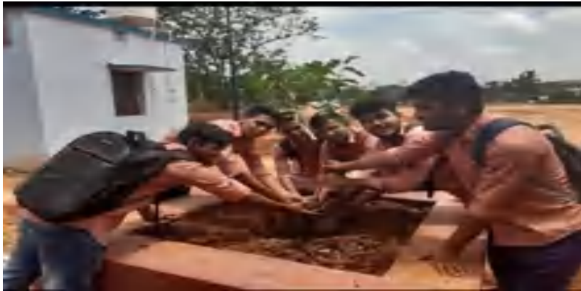
Plantation Drive Program