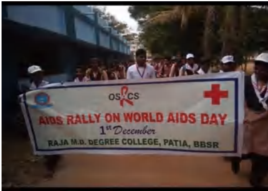
AIDS Day Rally