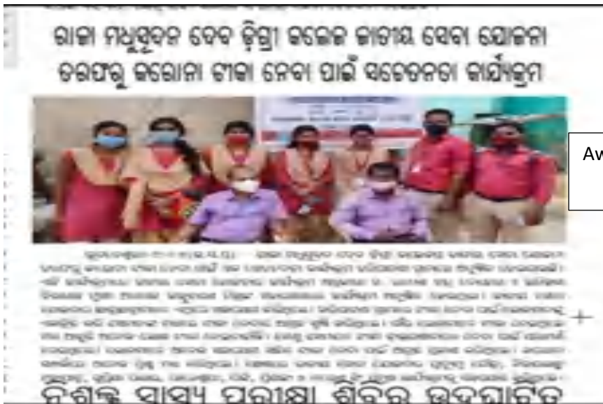
Awareness Program for Covid 19