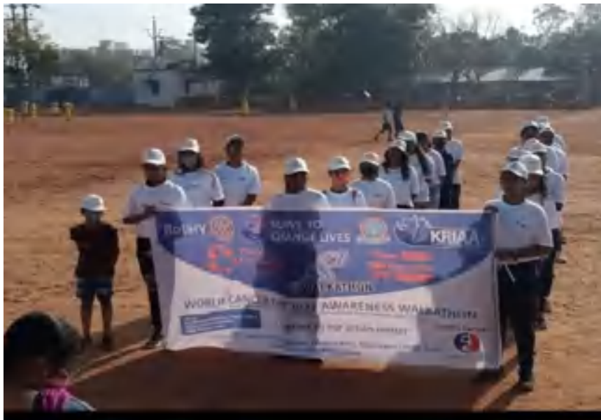
Cancer Day Rally