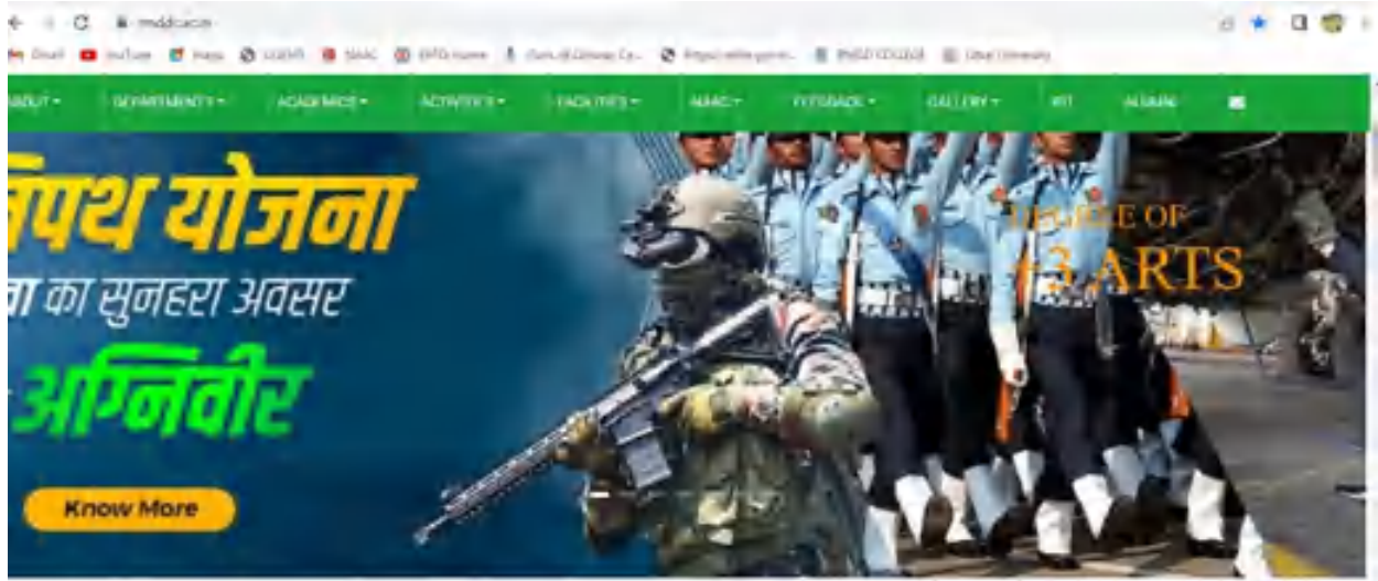
Agneepath Scheme Displayed on Institution website banner

Best practices in the Institutional web site